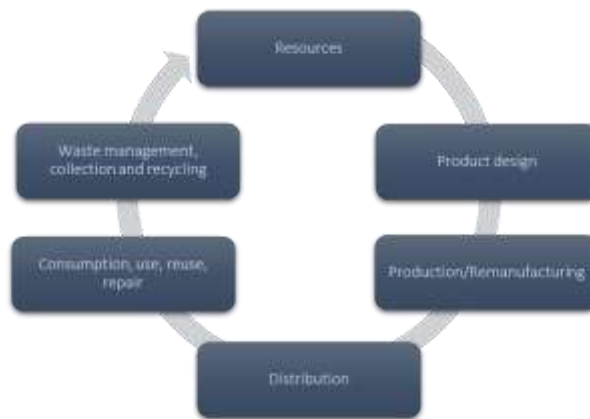
Figure 2: Closed production model

In a Circular Business Model (Figure 2), the resources are reused and kept in a loop of production and usage, allowing the generation of more value (Su et al. 2013; Urbinati et al. 2017 in Calvo-Porrá, C., Lévy-Mangin, J.P., 2020). Therefore, products and materials continuously circulate in so-called loops as long as they can provide value.